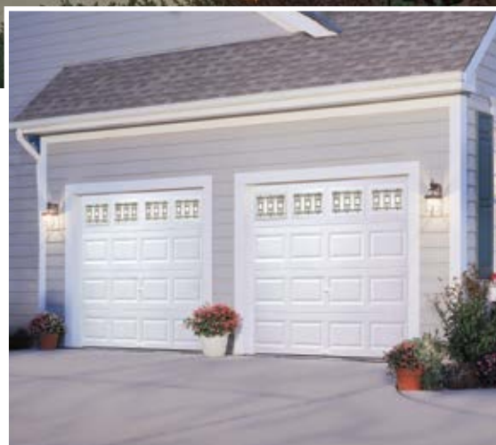
Model T41S, Short Traditional Panel with Optional Short Trenton® Window Design