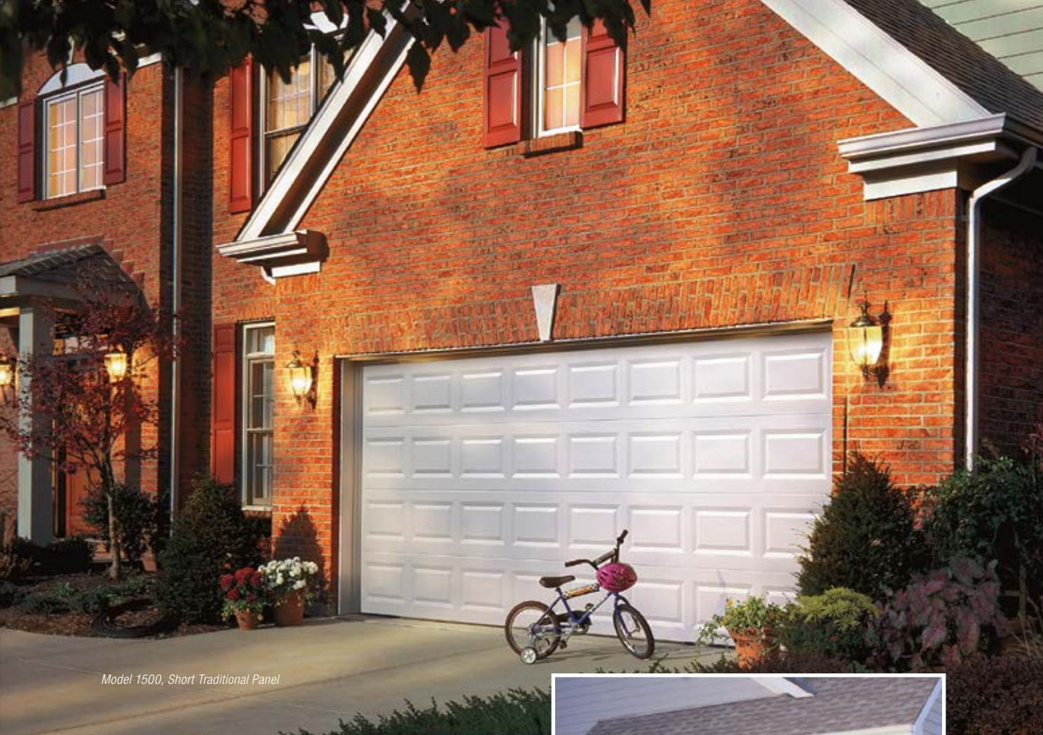
Model 1500, Short Traditional Panel