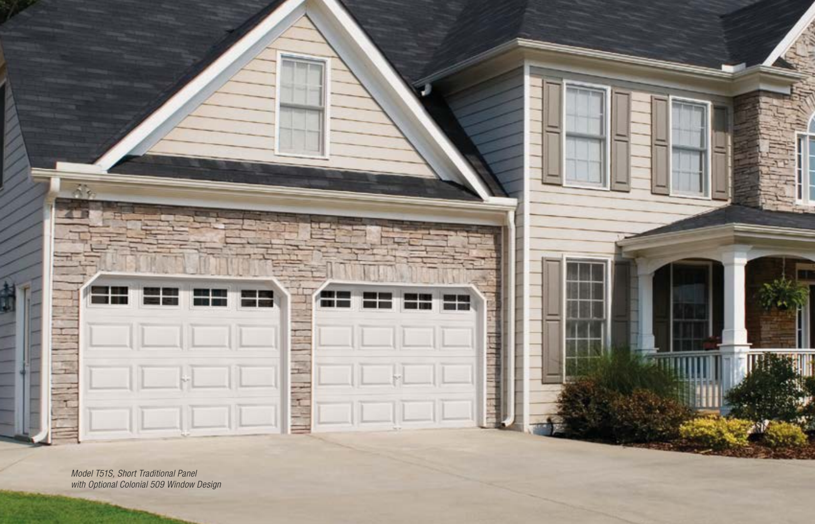
Model T51S, Short Traditional Panel with Optional Colonial 509 Window Design