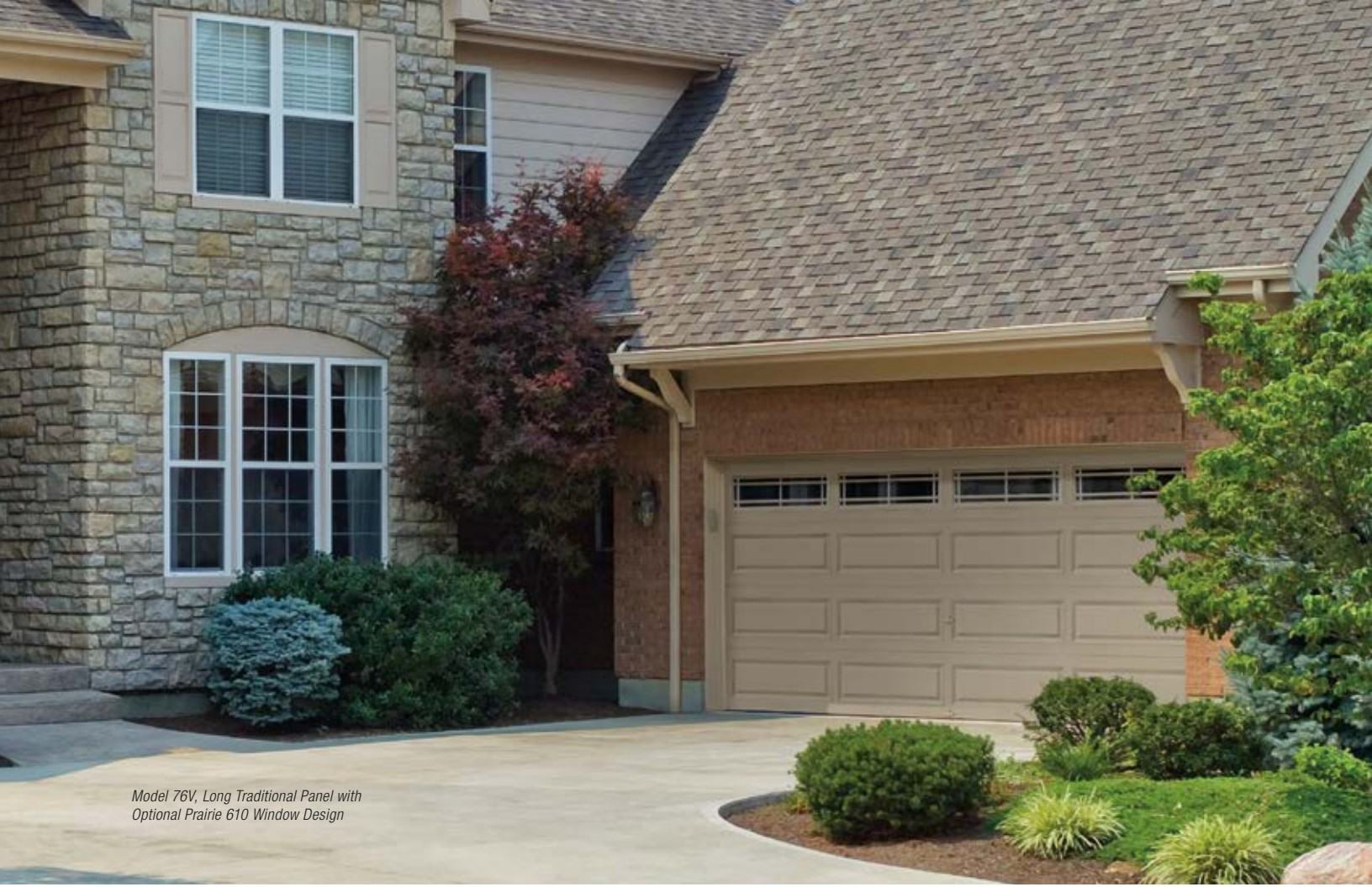
Model 76V, Long Traditional Panel with Optional Prairie 610 Window Design